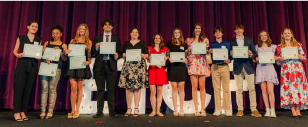
Scholarship recipients from Tyler Legacy High School.