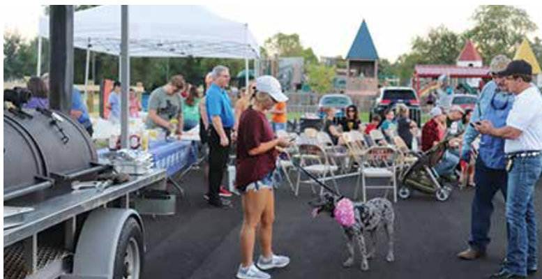
Families in Bullard enjoy the newly resurfaced parking at the Bullard Kids' Park during National Night Out.

If you are interested in giving to one of the projects listed, please contact our offices at 903-533-0208.